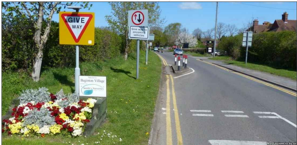
BUILDOUT ALONG WESTBOUND SIDE TO GIVE PRIORITY TO EASTBOUND TRAFFIC