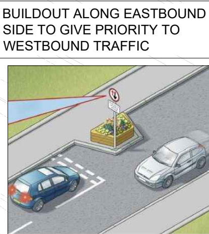
BUILDOUT ALONG EASTBOUND SIDE TO GIVE PRIORITY TO WESTBOUND TRAFFIC