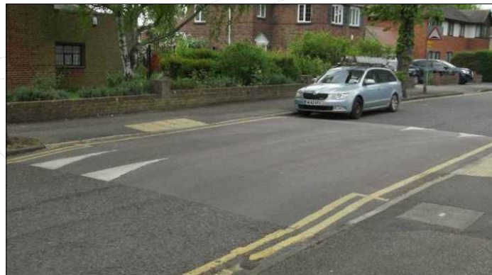
FLAT-TOP HUMPS OF TOTAL LENGTH 5.0m. RAMP GRADIENT OF 1 IN 10 PROVIDED WITH HEIGHT OF HUMPS AS 100mm