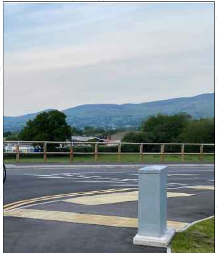
REVISED TACTILE PAVING AND PROPOSED CORDUROY PAVING IN ACCORDANCE WITH ACTIVE TRAVEL GUIDANCE AND GUIDANCE ON USE OF TACTILE SURFACE