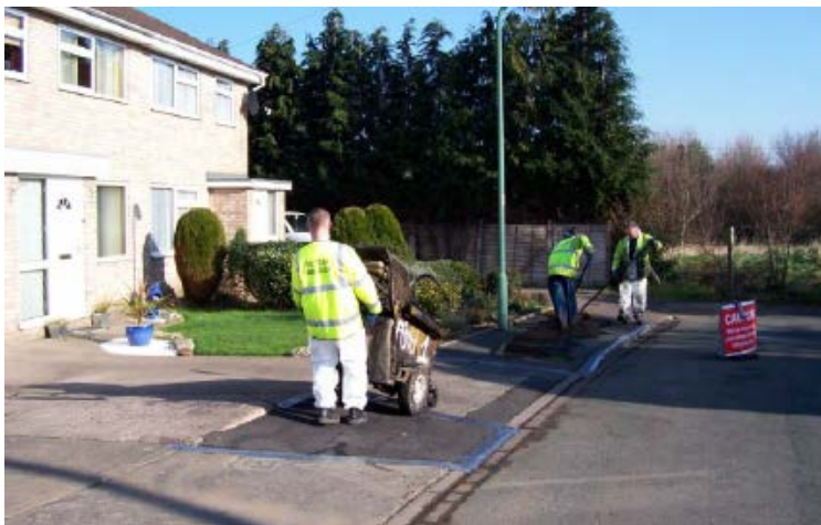
Micro – Surfacing (Before)