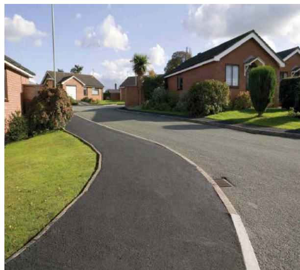
Micro – Surfacing (After)