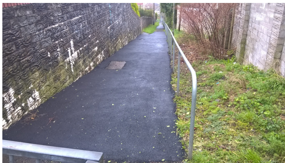
Footway after treatment