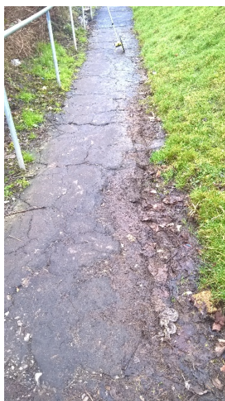
Footway Before treatment